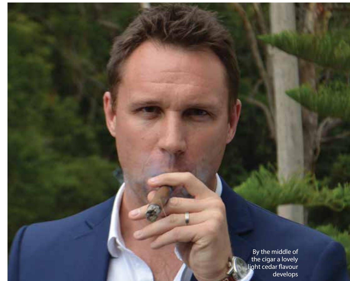
By the middle of the cigar a lovely light cedar flavour develops