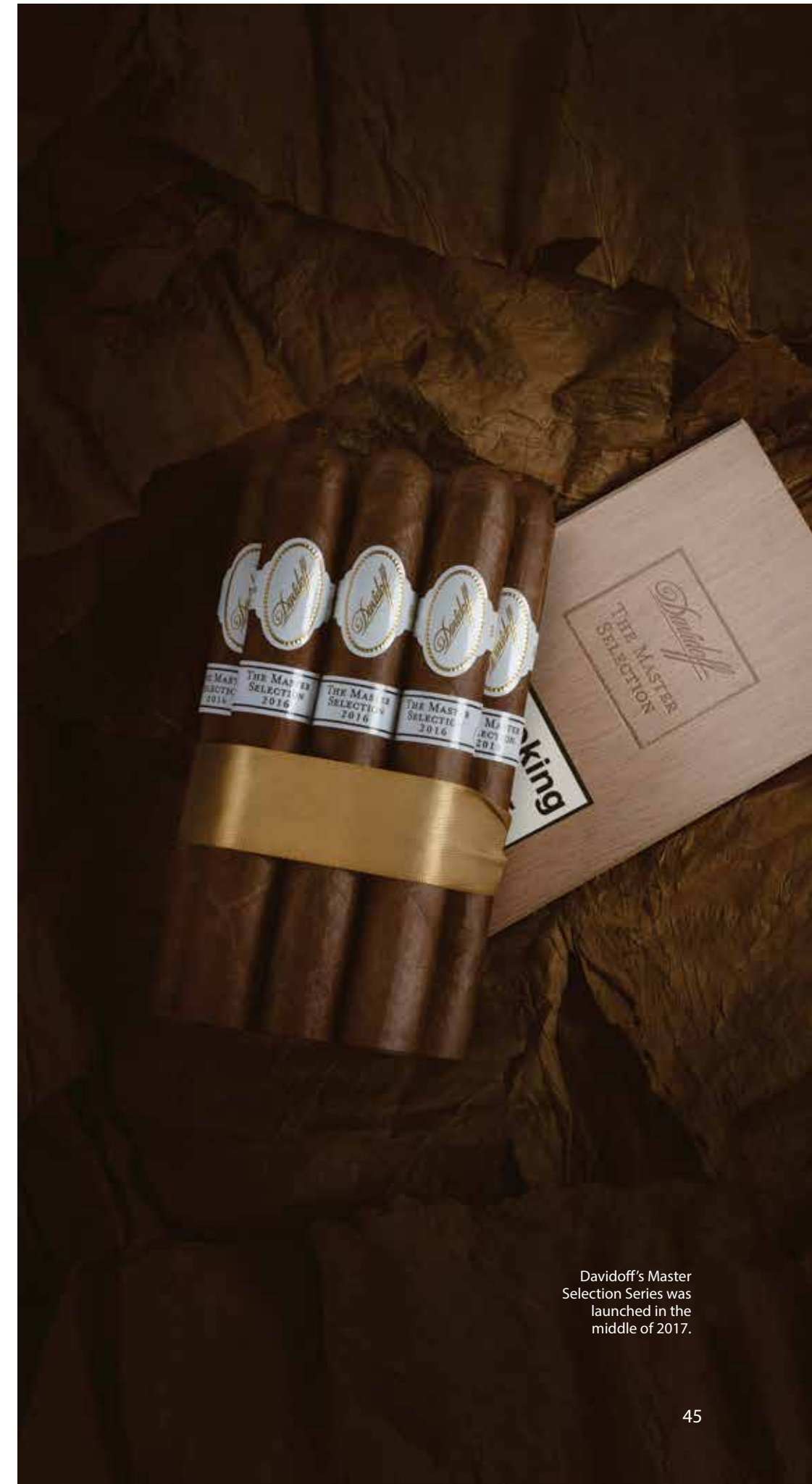
Davidoff’s Master Selection Series was launched in the middle of 2017.